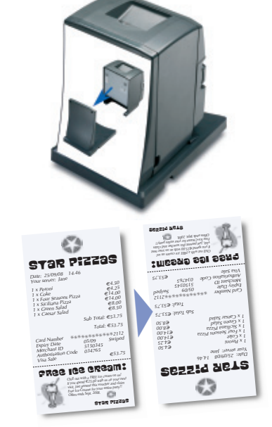
Wall mount bracket included at purchase with Auto-Reverse Receipt Software

■ All printer features available from the printer's properties page in Windows<sup>™</sup>