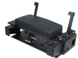
Flat Surface Mounted Armrest with Printer Bracket (C-ARPB-112 shown)