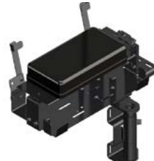
Side Mounted Pedestal Arm Rest with Printer Bracket (C-ARPB-106 shown)