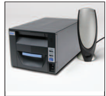
User Communication Tool