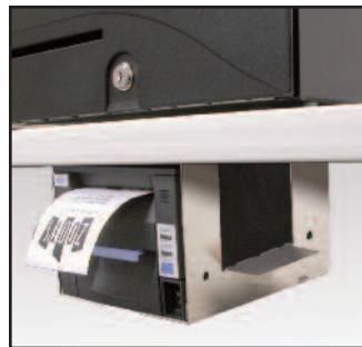
For Limited Counter Space