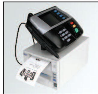
Space Enabling Design