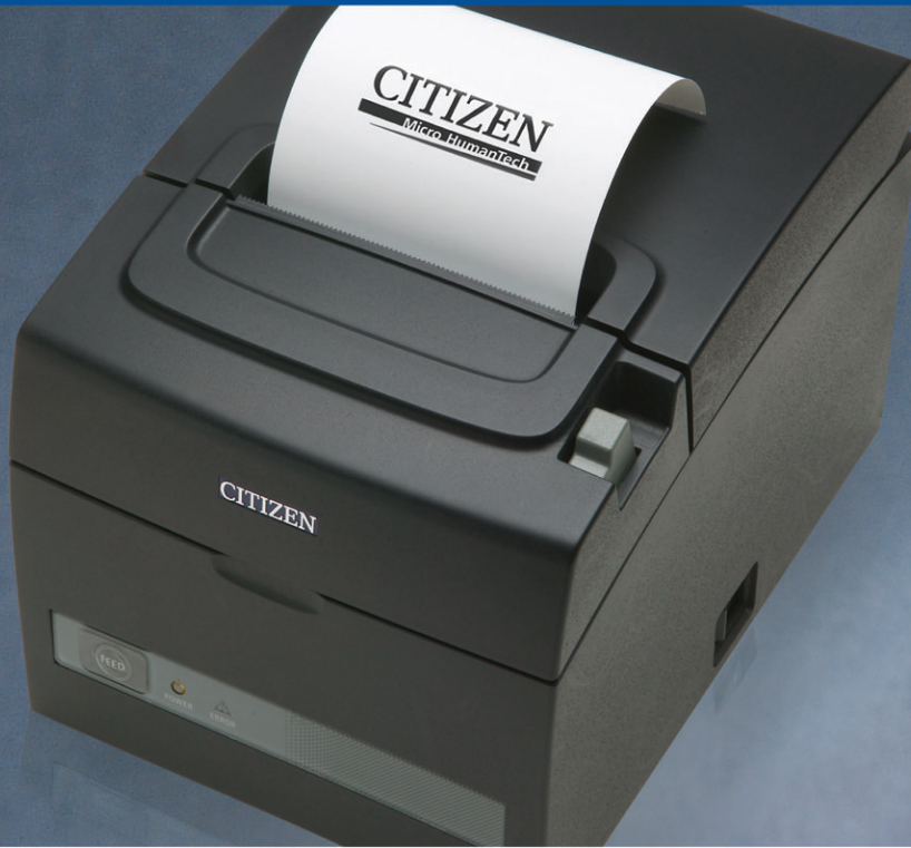
Cash Drawer Kickout