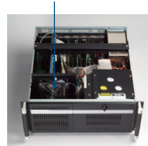
Easy-to-maintain system fan