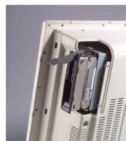
Removable 3.5" HDD Bay

Customers can choose from three optional types of standardized touchscreens: resistive, capacitive and SAW (Surface Acoustic Wave). These options make the PPC-174T a more user-friendly interface for different environments.