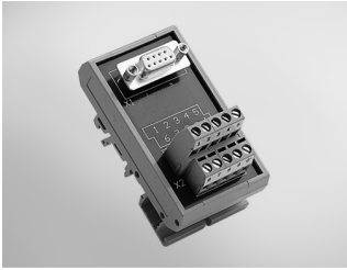
ADAM-3909 DB9 DIN-rail Wiring Board