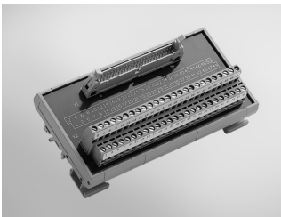
ADAM-3950 50-pin DIN-rail Flat Cable Wiring Board

PCI-1713U, PCI-1715U, PCI-1718HDU, PCI-1720U, PCI-1730U, PCI-1733, PCI-1734, PCI-1750, PCI-1760U, PCI-1761