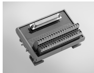
ADAM-3937 DB37 DIN-rail Wiring Board