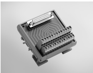
ADAM-3925 DB25 DIN-rail Wiring Board

PCI-1735U, PCL-711B, PCL-720+, PCL-726, PCL-727, PCL-730, PCL-812PG, PCL-816, PCL-818 Series, PCL-836