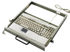
KBD-6312 Rackmount 105-key Keyboard with Touchpad