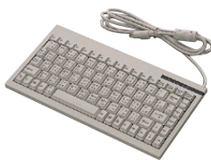
KBD-6304 Compact 88-key Keyboard