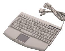
KBD-6305 Compact 88-key Keyboard with Touchpad