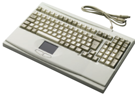
KBD-6307 105-key Keyboard with Touchpad