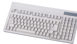
PCA-6302 Compact 104-key Keyboard