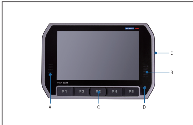
A. B. Speaker C. User-defined hotkeys D. Light sensor E. Reset, power, USB host (side)