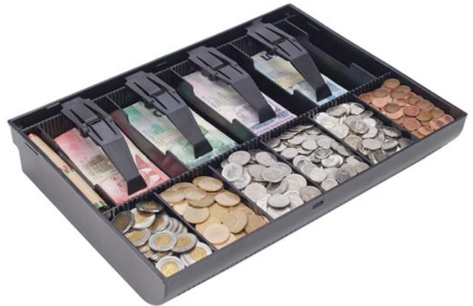
Canadian Configuration: 4B/6C P/N 226 199CNPL1004