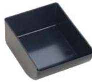
US Coin Cup Set of 5 Cups P/N 226 199USCUP104