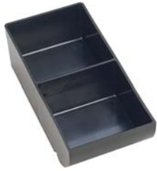
Coin Expansion Cup P/N 226 199USCUP204