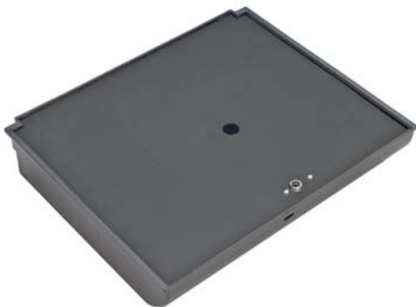
Steel Locking Till Cover P/N 226 199TILCVR04