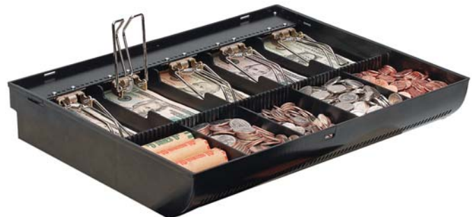
Metal Bill Weights