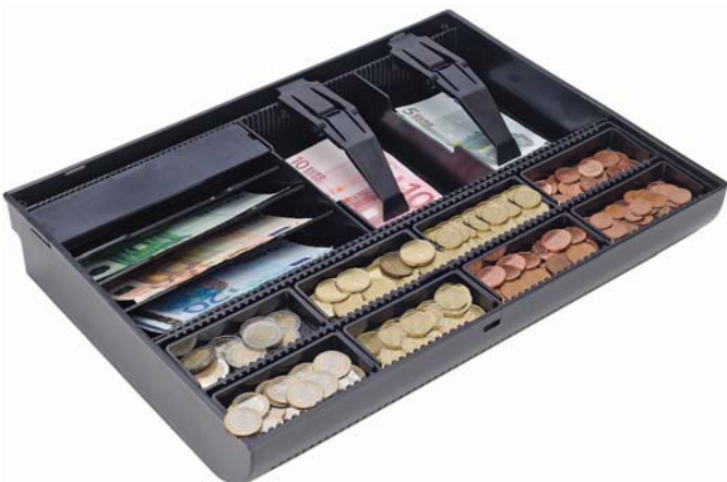
Euro Split: 4B Slant, 2B Flat/8C P/N 226 199EUSP1004