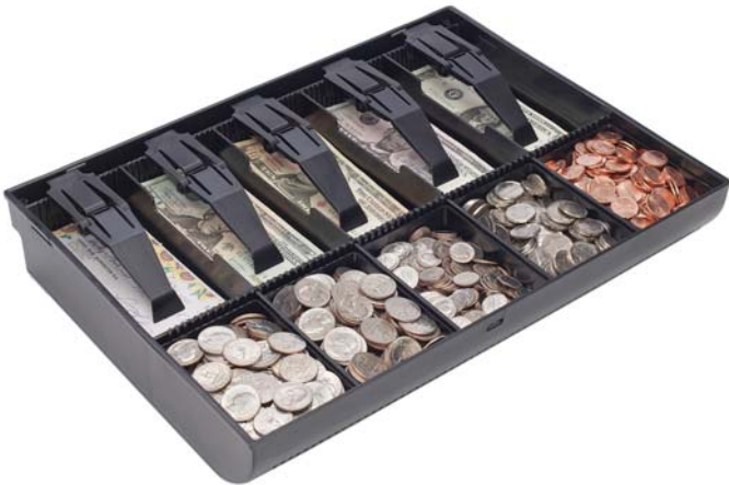
U.S. Configuration: 5B/5C P/N 226 199USPL1004

The Advantage Series' unique Global Till measures 15.75" W x 12" D x 2.5" H boasts twice the capacity of most other tills and a modular design which can be configured for all of the following currencies: