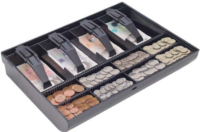
U.K. Configuration: 4B/8C P/N 226 199UKPL1004