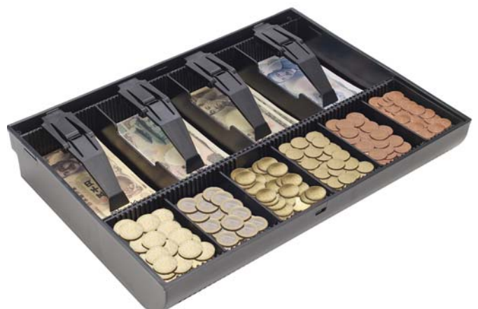
Asian Configuration: 4B/6C P/N 226 199ASPL1004