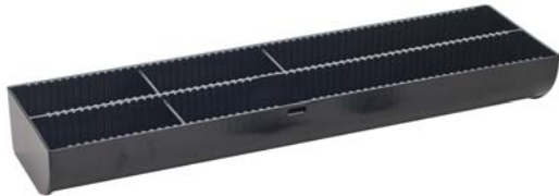
Removable Coin Tray Euro and US configurations