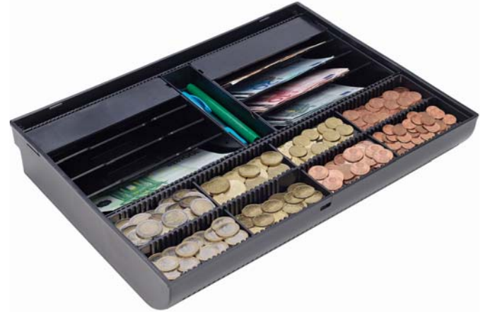
Euro Configuration: 8B Slant/8C P/N 226 199EUSL1004