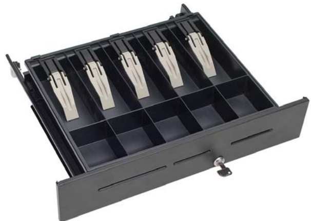
Global Till Conversion Kit P/N 226 199CONV0100