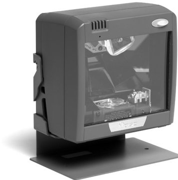
Optional Riser Mount

EAS compatibility Integrated EAS hardware will work with Counterpoint IV, V, VI and VII models available from Checkpoint® Systems.