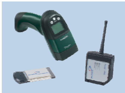
Dragon/DL Cordless Card/STAR-Modem™