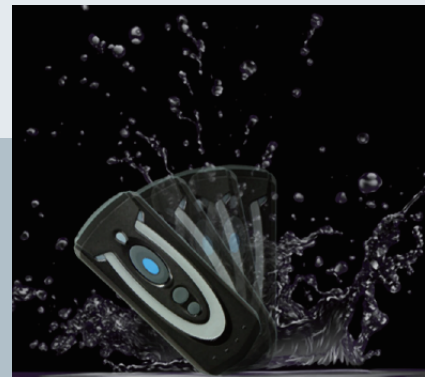
Rugged and Durable