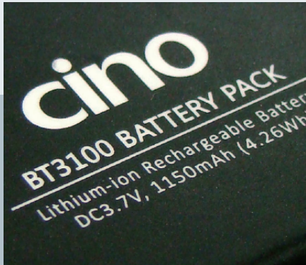
Efficient Power Management

Thanks to the special designed mounting holes, the smart cradle can be flexibly linked together to form a multi-slot cradle by a small hard plate. You can get an instant multi-slot cradle solution without any extra investment and effort.