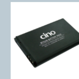
Battery: 1150mAh 2300mAh