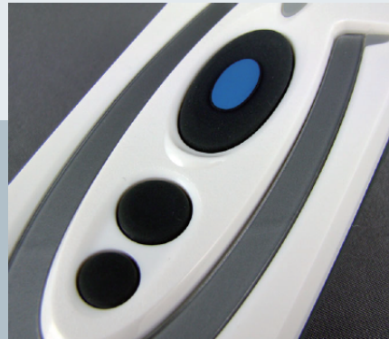
User-friendly Function Keys