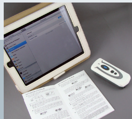
Several Radio Link Modes