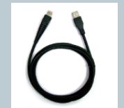
Cable: USB PS/2 RS232 Micro USB