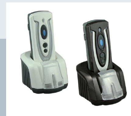
Smart Cradle Solution