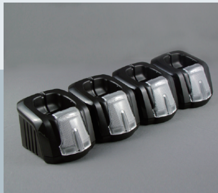
Multi-slot Cradle Solution