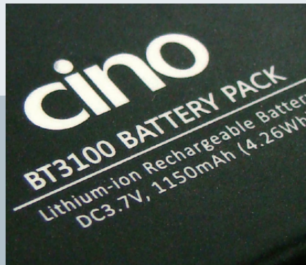
Efficient Power Management

Thanks to the special designed mounting holes, the smart cradle can be flexibly linked together to form a multi-slot cradle by a small hard plate. You can get an instant multi-slot cradle solution without any extra investment and effort.