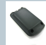
Battery Cover (for 2300mAh)