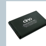
Battery: 1150mAh 2300mAh