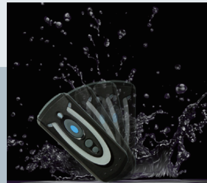
Rugged and Durable