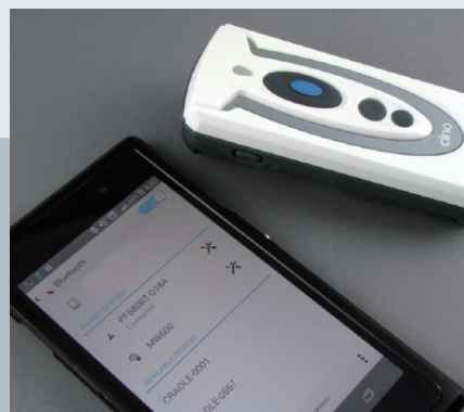
Bluetooth v 4.0 Technology

Cino Bluetooth pocket scanner can work with non-Bluetooth hosts, such as traditional desk top computer, through smart cradle in PAIR mode or PICO mode. This provides an instant plug-and-play cordless migration solution. In PICO mode, one smart cradle supports up to 7 scanners simultaneously. This can reduce the total IT infrastructure cost.