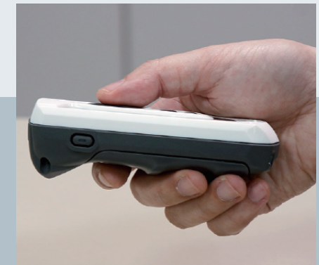
Ergonomic Outer Shell