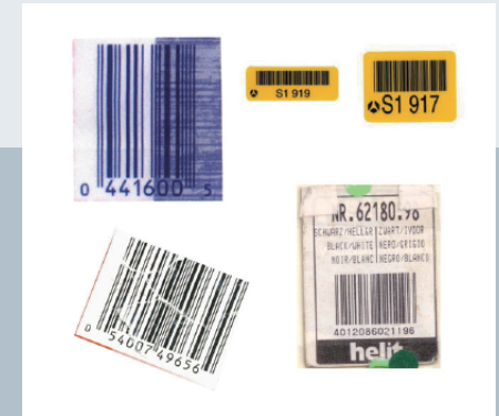
No Worry for Poor Barcodes