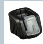
Smart Cradle Charging Cradle