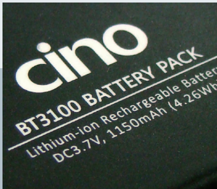
Efficient Power Management

Thanks to the special designed mounting holes, the smart cradle can be flexibly linked together to form a multi-slot cradle by a small hard plate. You can get an instant multi-slot cradle solution without any extra investment and effort.