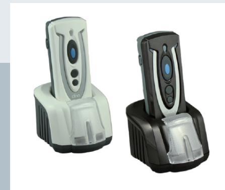
Smart Cradle Solution