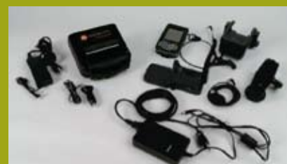
Accessories used in a typical application involving a separate printer and mobile computer.