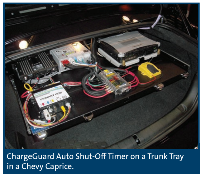
ChargeGuard Auto Shut-Off Timer on a Trunk Tray in a Chevy Caprice.