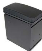
C-CB-2 Combination box with hinged armrest and no lighter plug outlets