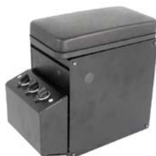
C-CB-1 Combination box with hinged armrest and 3 lighter plug outlets