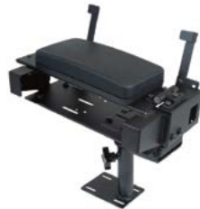
Pedestal Armrest with Printer Bracket (C-ARPB-108 shown)