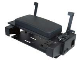
Flat Surface Mounted Armrest with Printer Bracket (C-ARPB-112 shown)