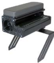
Top Mount Arm Rest with Printer Bracket (C-ARPB-101 shown)