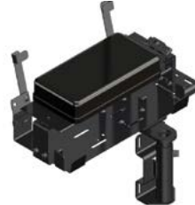
Side Mounted Pedestal Arm Rest with Printer Bracket (C-ARPB-106 shown)