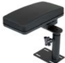
Armrest for Tunnel Mount with Hinged Pad C-ARM-104