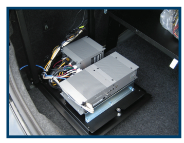
Locking latch provides a safe and secure mounting area. (C-TSM-CHGR-D shown)