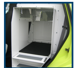
K9 Unit Order KK-K9-F14-K to convert your Expedition into an efficient K9 transport vehicle. Also available as K9/Prisoner Transport unit, as shown. (C-KK-K9-F14-K-PT shown)