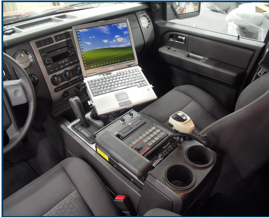
C-VS-1200-EXPD-1 shown with optional mic clip bracket, arm rest, and Telescoping Computer Mount.

This new vehicle-specific OEM replacement console provides a professional and custom appearance for 2007-2010 Expeditions with OEM center shift console. The formed steel housing and extruded aluminum top frame provide strength for mounting up to 12" of emergency equipment.