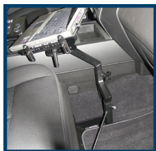
Telescoping Computer Base Secure your laptop to a TCB base. Height adjustable with dual articulating discs allow for perfect adjustment. Shown with C-TCB-OSP (offset pole assembly) (C-TCB-5 & C-TCB-OSP available)