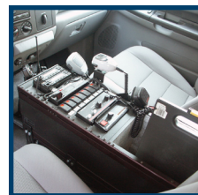
Enclosed Console Use your Trak-Mount to attach many types of consoles and computer mounts. (C-3011 shown) For Expedition SSV only.