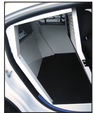
K9 Transport System ( KK-K9-D24-K )