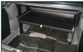
Single Shelf Trunk Tray ( C-TTB-CHGR-3 )