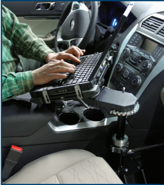
Above photo shows Premium Package for another vehicle