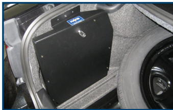
Driver Side Trunk Mount ( C-TSM-CHGR-D-1 )