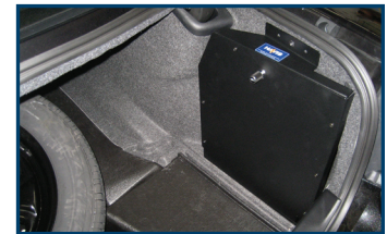
Passenger Side Trunk Mount ( C-TSM-CHGR-P-1 )