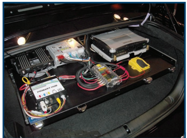
ChargeGuard Auto Shut-Off Timer on a Trunk Tray in a Chevy Caprice.