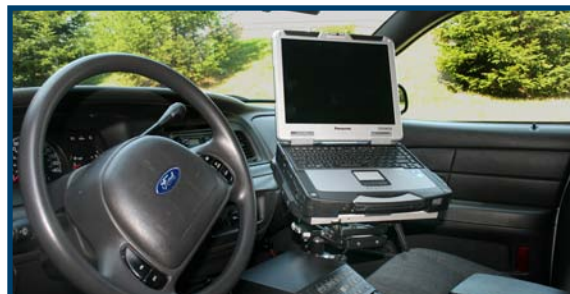
DS-PAN-111 Docking Station with a Panasonic Toughbook 31 inside a Ford Crown Vic.

Panasonic Toughbook Certified, MIL-STD-810G, SAE J1455, CISPR 22, CE and FCC compliant