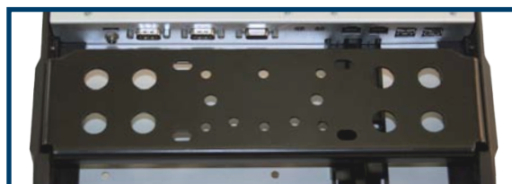
Mounting Bracket with integrated hole patterns to accommodate most competitors mounting devices.