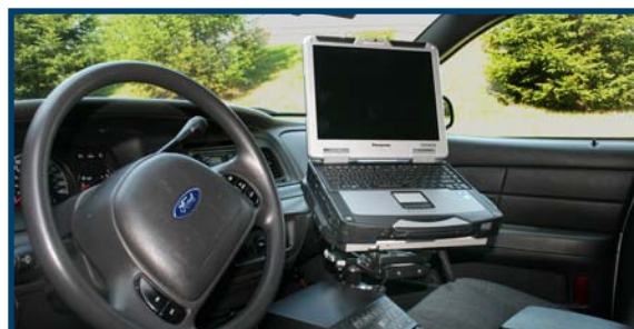
DS-PAN-111 Docking Station with a Panasonic Toughbook 31 inside a Ford Crown Vic.

Panasonic Toughbook Certified, MIL-STD-810G, SAE J1455, CISPR 22, CE and FCC compliant