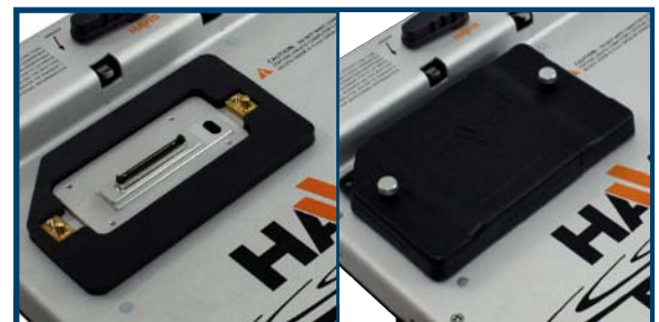
Docking Connector Gasket (Left) ensures water and dust protection while computer is docked. Docking Connector Cover (Right) protects Connector while computer is not docked.