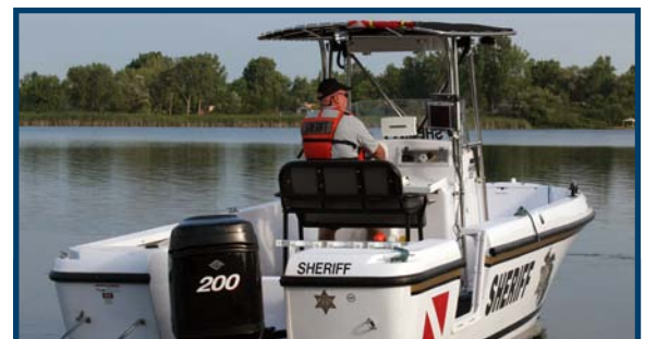
DS-PAN-214 with a Toughbook 19 inside a Dive and Rescue Boat.