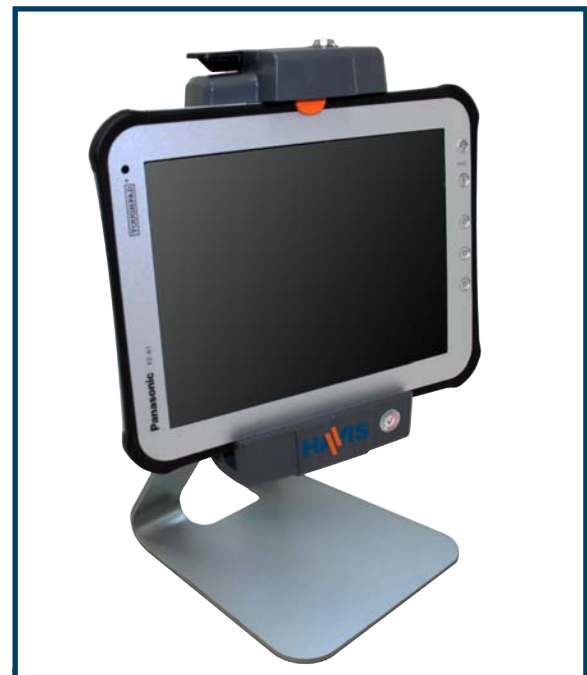
Docking Station is shown with a Havis Desktop Stand. (optional accessory, Part #: DS-DA-218)

The DS-PAN-500 Series Docking Station offers computer charging, security, and connection to peripherals in medical, enterprise, and in-vehicle workplaces. Maximize your productivity with this lightweight and strong design that is built with theft deterrence, longevity and stability in mind.