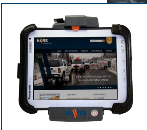
Tablet docks securely with hand strap attached