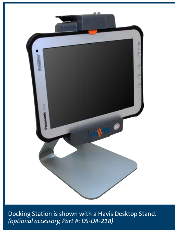
Docking Station is shown with a Havis Desktop Stand. (optional accessory, Part #: DS-DA-218)

The DS-PAN-500 Series Docking Station offers computer charging, security, and connection to peripherals in medical, enterprise, and in-vehicle workplaces. Maximize your productivity with this lightweight and strong design that is built with theft deterrence, longevity and stability in mind.