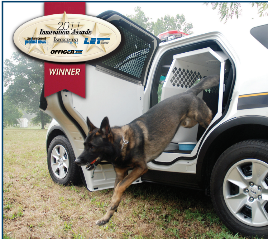
Ford Explorer K9 Kit (Part # KK-K9-F16-K)