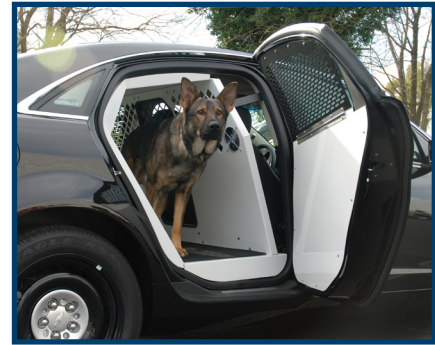
Chevrolet Caprice K9 Kit (Part # KK-K9-C22-K)