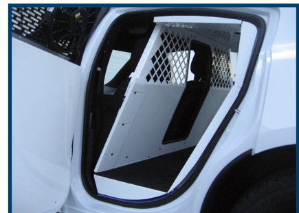
Dodge Charger K9 Kit (Part # KK-K9-D24-K)