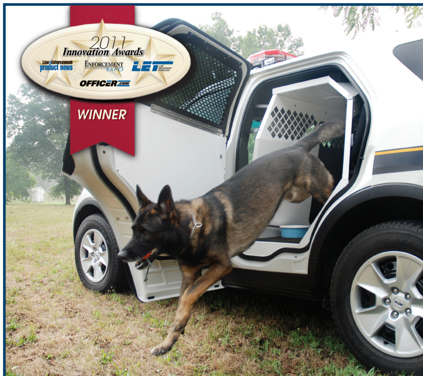
Ford Explorer K9 Kit (Part # KK-K9-F16-K)