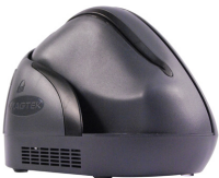
ImageSafe Dual-sided scanner with integrated secure card reader authenticator