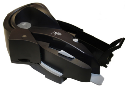
Excella High-volume, dual-sided scanner with rear side endorsement printer