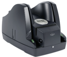
Excella STX Dual-sided scanner with front side franking and rear side endorsement printer and integrated secure card reader authenticator

- Jeff Hardy, CEO, TOPS Software LLC. Product: Excella STX