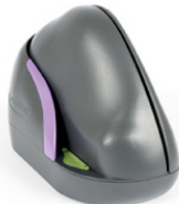
MICRImage Single-sided scanner with magstripe card reader

Call a representative to learn more 562-546-6400