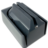
Mini MICR Single-sided scanner with magstripe card reader