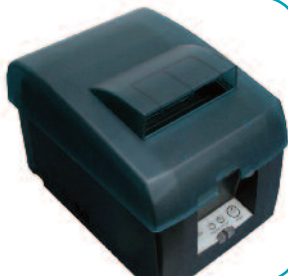
Optional Splash Proof Cover