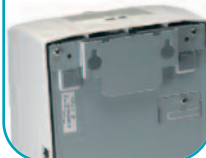
Vertical Wall Mount