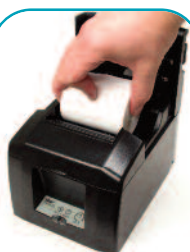
Easy Drop-In & Print