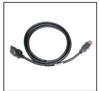
PoweredUSB Cable Included