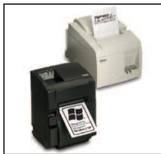
Gray or Putty