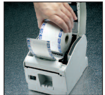
"Drop In & Print" Paper Loading