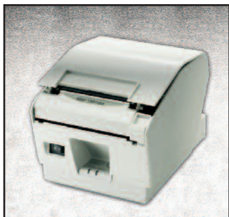
Clamshell, Spill and Dust Proof Design