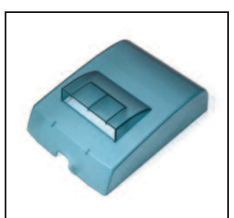
Splash Proof Cover