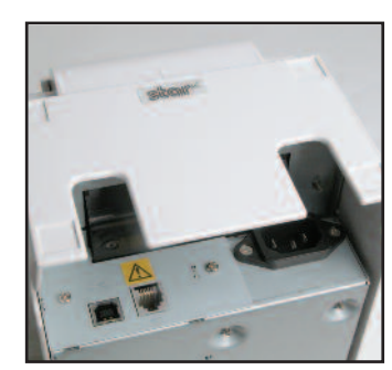
Embedded Power Supply