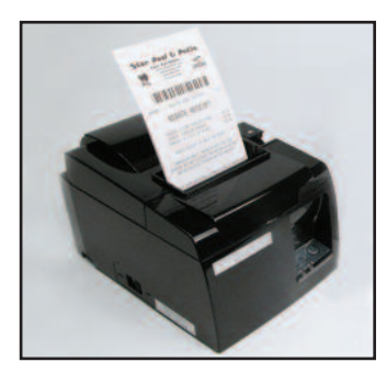
Sophisticated, High Gloss Cover