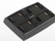
• 94A150039 4-Slot Battery Charger