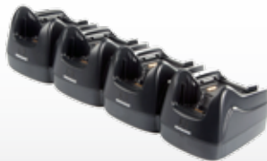
• 94A150037 4-Slot Charging Dock • 94A150038 4-Slot Ethernet Dock