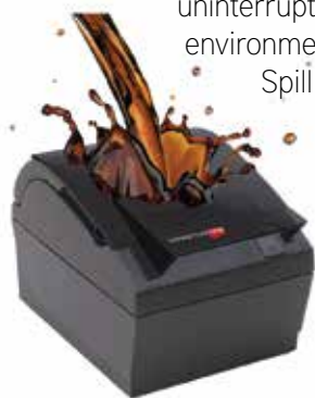
A798 with Spill Guard Accessory

The A798 was designed to withstand conditions in normal retail and hospitality environments where damage can occur. Designed with a liquid dam and unique drainage features, the A798 offers uninterrupted printing. For harsher environments, we also offer an optional Spill Guard accessory.