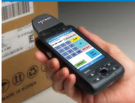
SoMo 650 with optional CF Scan Card barcode scanner (sold separately)