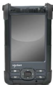
SoMo 650 with optional DuraCase protective case (sold separately)