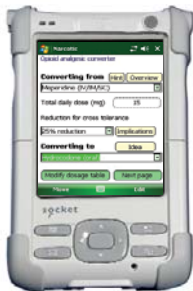
SoMo 650Rx with optional DuraCase protective case (sold separately)

"The SoMo 650 provides the features and the flexibility that is needed in healthcare and does it in a package that can be supported at an enterprise level."