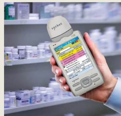
SoMo 650Rx with optional CF Scan Card 5XRx 2D barcode scanner (sold separately)

*Requires Socket Enhanced Wi-Fi® Companion™ software, optional to install.