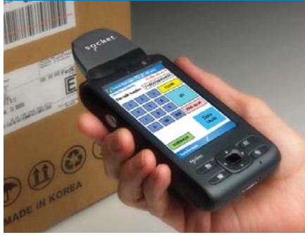
SoMo 650 with optional CF Scan Card barcode scanner (sold separately)