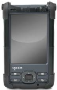
SoMo 650 with optional DuraCase protective case (sold separately)