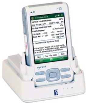
SoMo 650Rx in optional charging cradle