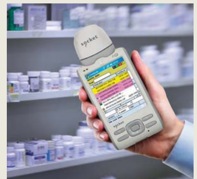
SoMo 655Rx with optional CF Scan Card 5XRx 2D barcode scanner (sold separately)

*Requires Socket Enhanced Wi-Fi ® Companion™ software, optional to install.