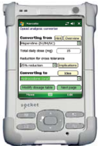
SoMo 650Rx with optional DuraCase protective case (sold separately)

"The SoMo 650 provides the features and the flexibility that is needed in healthcare and does it in a package that can be supported at an enterprise level."