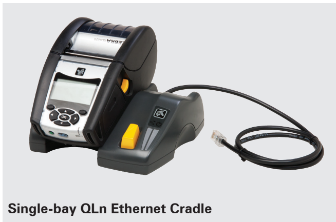
Single-bay QLn Ethernet Cradle