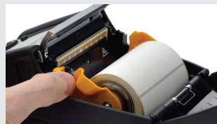
Intuitive peeler operation