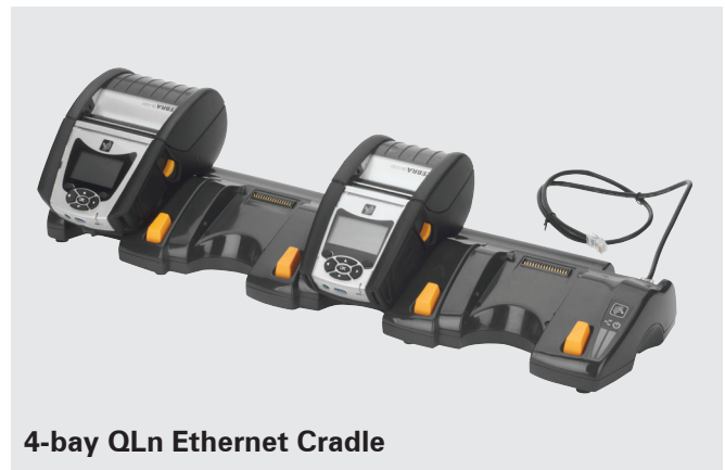
4-bay QLn Ethernet Cradle