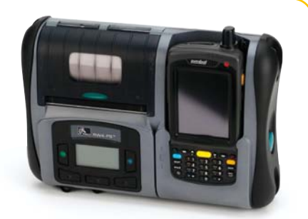
RW 420 Print Station with MC70/MC75 terminal