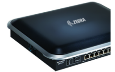
RFS 4011 available only with WING 5.

Secure guest access (Hotspot provisioning) Provides secure guest access for wired and wireless clients. built-in captive portal, customizable login/ welcome pages, URL redirection for user login, usage-based charging, dynamic VLAN assignment of clients, DNS white list, GRE tunneling of traffic to central site*, API support for interoperability with custom web portals* support for