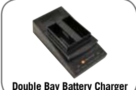
Double Bay Battery Charger