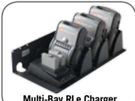
Multi-Bay RLe Charger