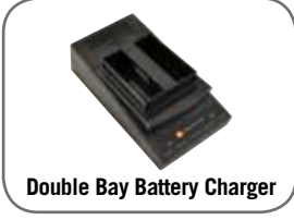
Double Bay Battery Charger