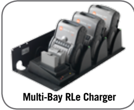
Multi-Bay RLe Charger