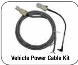
Vehicle Power Cable Kit