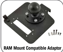
RAM Mount Compatible Adaptor