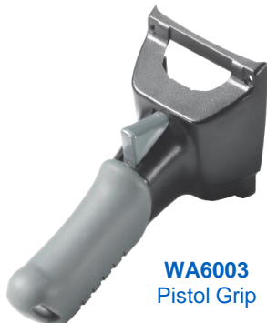
WA6003 Pistol Grip

WA6003 Pistol grip attachment for slim pod