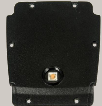
WA9302 Trigger Board for 1D Laser or 1D/2D Imager End-Cap

! Trigger board WA9302 is required for 1D laser or 1D/2D imager ONLY when using the pistol grip