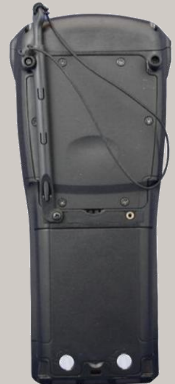
WA6310-G1 Mobile Stylus with Holder Kit