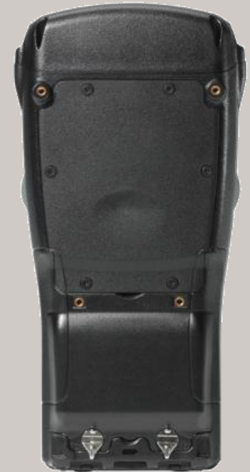
WA6216 Standard Blank Back-Cover