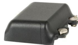
WA3018-G2 Battery door for short configurations