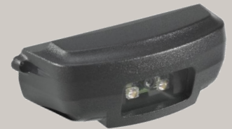
WA9020 2D Imager

! All end-cap scanners and pistol grip are compatible with short and long configurations