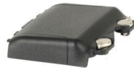
WA3016-G2 Battery door for short configurations