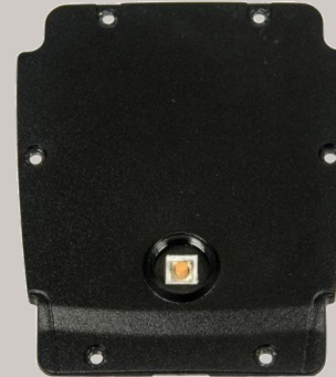
WA9301 Trigger Board for Lorax Laser End-Cap

! Trigger board WA9301 is always required when using WA9022 Lorax laser end-cap with or without pistol grip