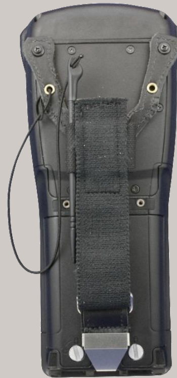
WA6025 Hand Strap with Mobile Stylus