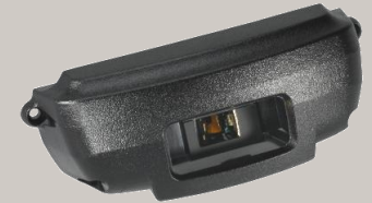
WA9016 1D Standard Range Laser