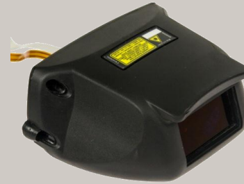
WA9022 1D Lorax Laser

! When using WA9022 Lorax Laser end-cap with or without pistol grip, a trigger board WA9301 is required For all other end-cap engines, a trigger board WA9302 is required ONLY when using the pistol grip.