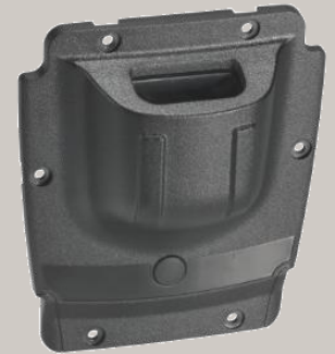
WA9017 1D Linear Imager