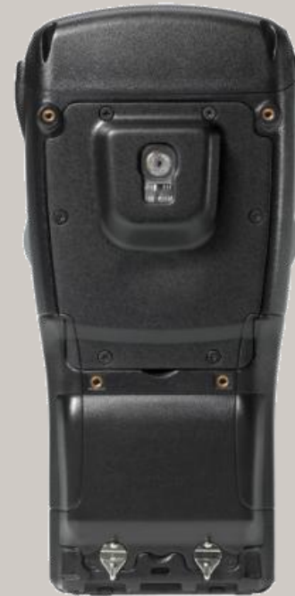
WA9021 8MP Camera Module