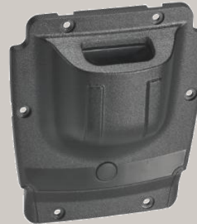
WA9019 2D Imager