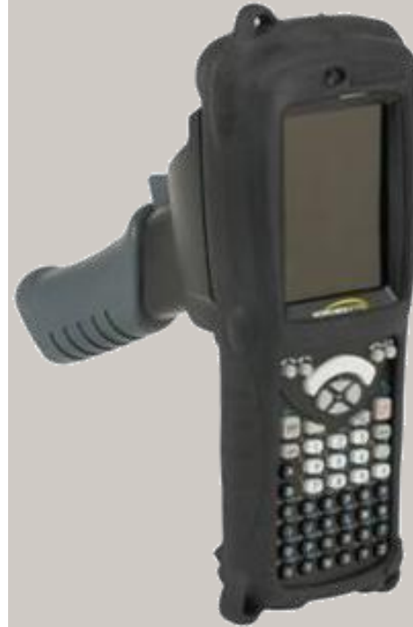
WA6400 Rubber Boot