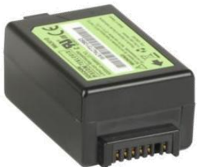
WA3010 Spare battery, 4400 mAh

If you're changing battery types, a battery door is required when purchasing 3300 mAh or 4400 mAh batteries