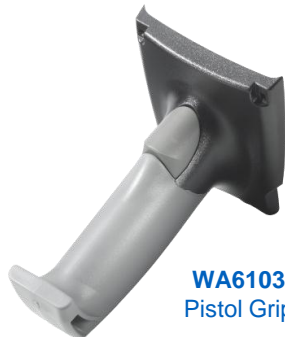
WA6103 Pistol Grip

WA6103 Pistol grip attachment kit. Includes flush mount pistol grip with trigger, and screws