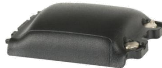
WA3017-G2 Battery door for long configurations