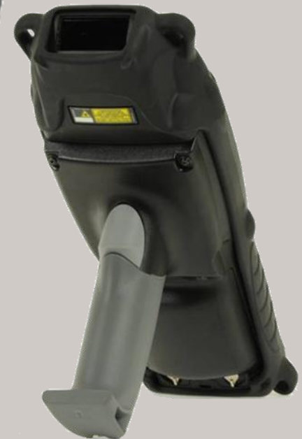
WA6402 Rubber Boot for Long Extended Range Laser