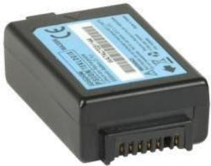
WA3025 Spare battery, 2760 mAh