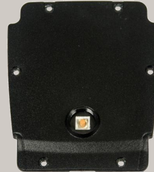
WA9301 Trigger Board for Lorax Laser End-Cap

Trigger board WA9301 is always required when using WA9022 Lorax laser end-cap with or without pistol grip