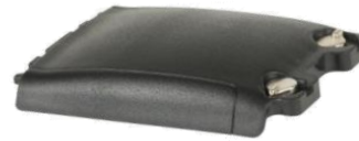
WA3015-G2 Battery door for long configurations