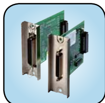
Plug-In Interface Modules